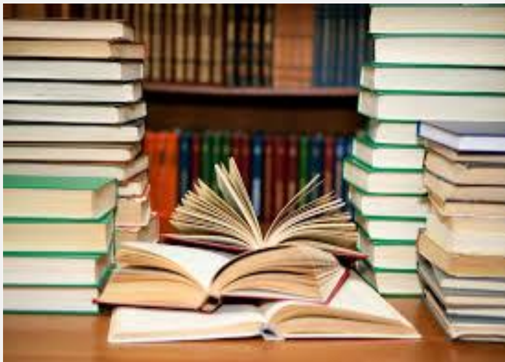
SPIT CENTRAL LIBRARY