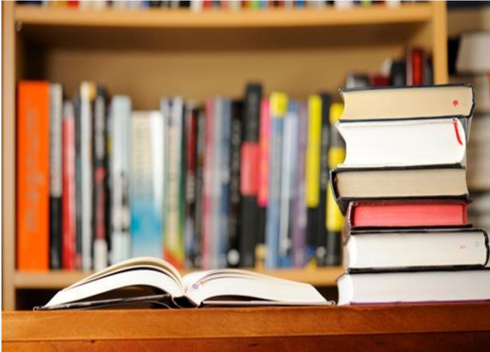
SPIT CENTRAL LIBRARY