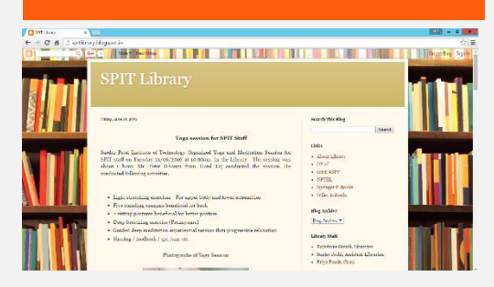
Library Blog http://spitlibrary.blogspot.in/