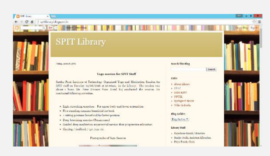
Library Blog http://spitlibrary.blogspot.in/